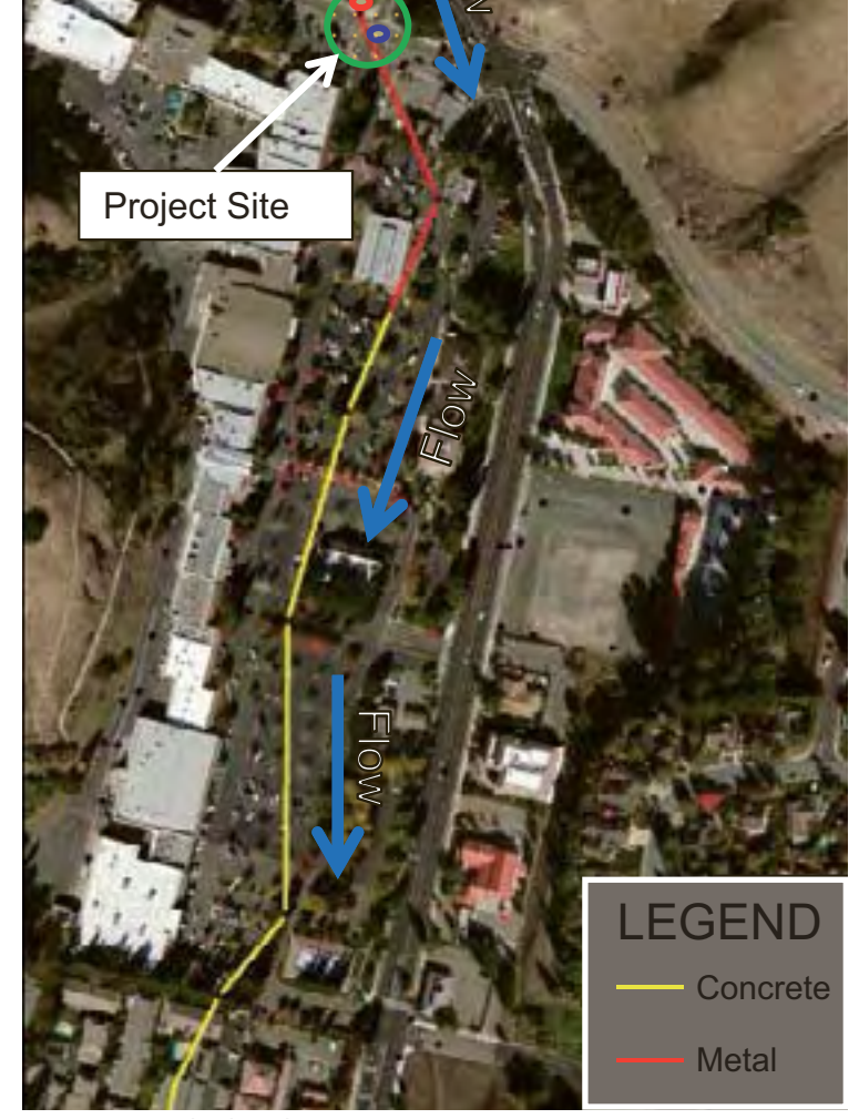
Project site and culvert location

Kwan plans to expedite the requests for proposal and the bidding process to be able to start work as soon as possible. All repair work is scheduled to be completed by the start of the rainy season, mid October.