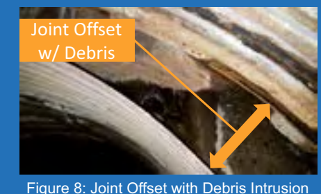
Figure 8: Joint Offset with Debris Intrusion